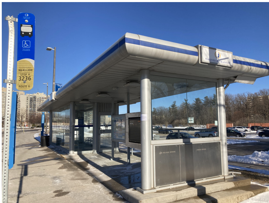
Unused Sheridan College bus terminal, Oakville.

Transit workers across the GTA are also beginning to complain of increased risk of physical assault since the beginning of the pandemic . Picketers maintain however that most public transit users behave reasonably when using public transit.